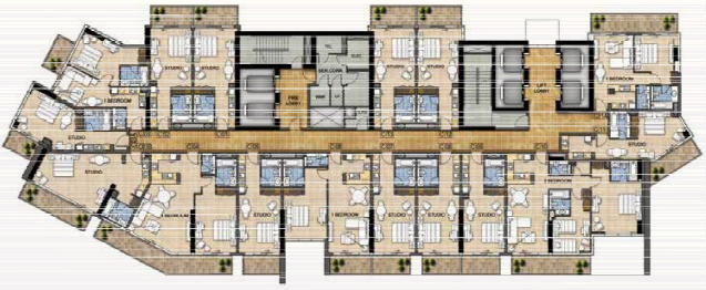
LEVELS 4-7 9-10 12-13 & 15