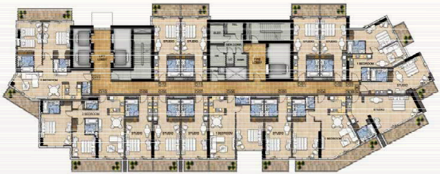
LEVELS 4-6 9-12