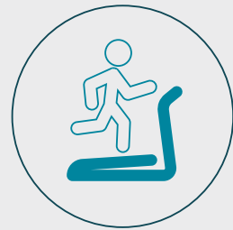
Stand-alone bespoke gym