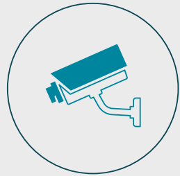
Safe & secure residential building