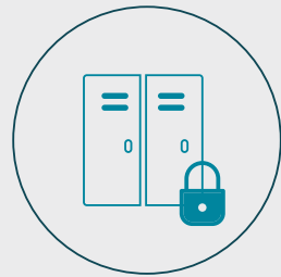
Changing rooms and lockers