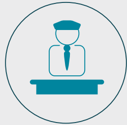
Spacious lobbies with concierge service