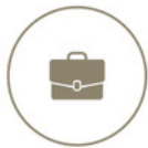
FOUNDER AND CHAIRMAN, SOBHA GROUP